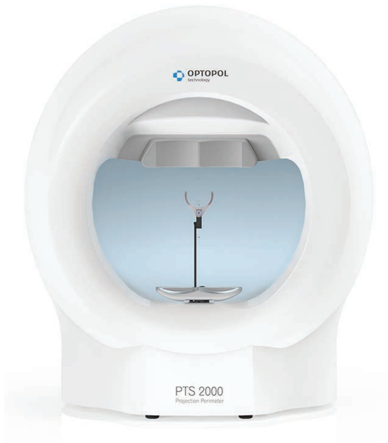
Table Dims: 24" x 33" Unit Dims: 21" x 24" x 17", 38 lbs.

Fast and precise perimetry at your fingertips