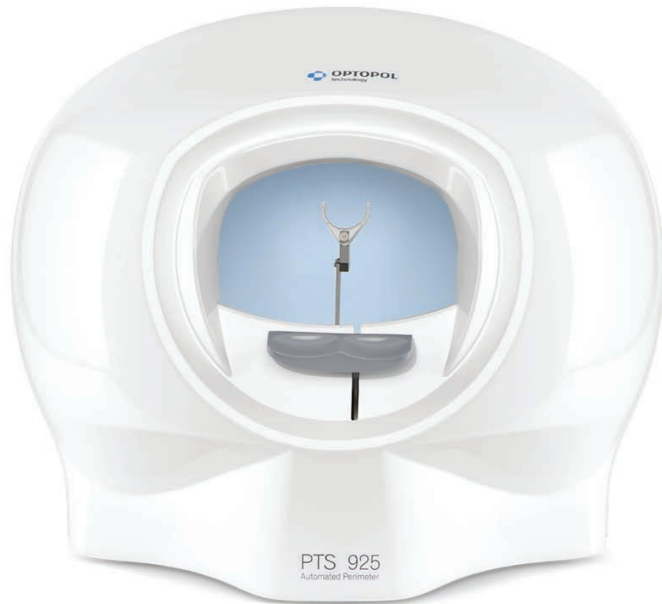
Table Dims: 24" x 28"

Fast and precise perimetry at your fingertips